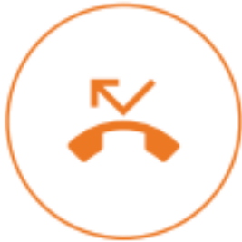
Missed Call Tracking